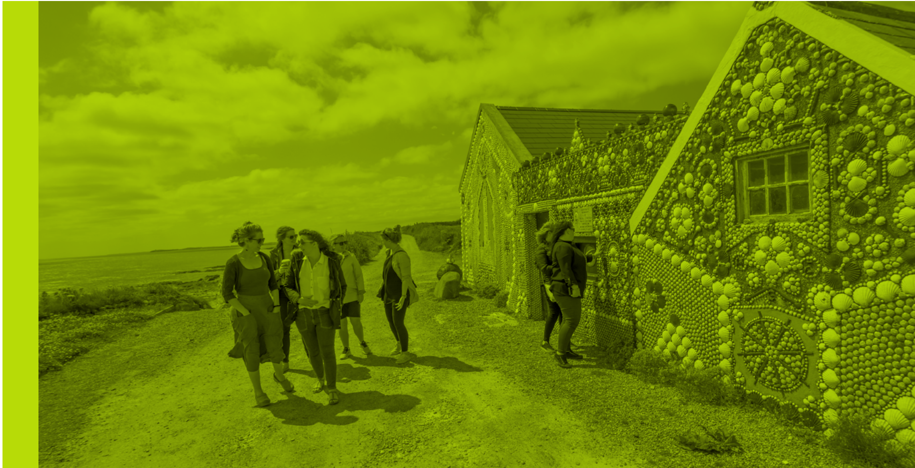
Site visit Cullenstown Beach, Wexford Think Tank 2018.