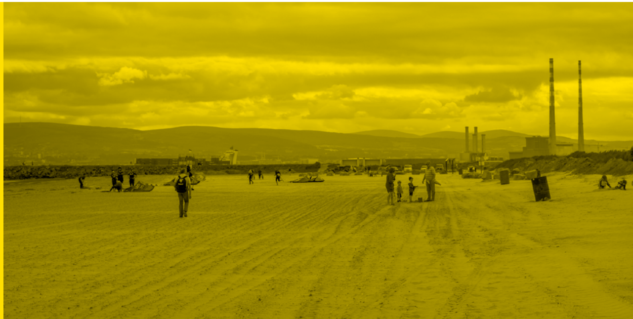
Dublin Think Tank and site visit to Bull Island.